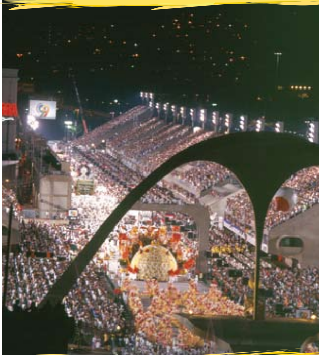
THE SAMBADROME IN RIO

Sambadrome. The celebrations are broadcast live on television to all Brazil and even some other countries.