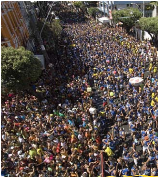
CARNIVAL CROWDS IN BAHIA