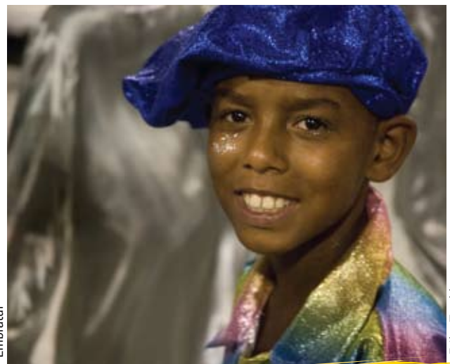
CARNIVAL DOLLS, OLINDA