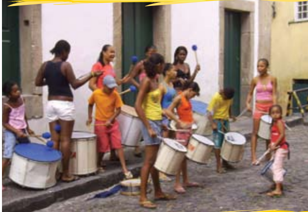
DRUMMERS IN BAHIA