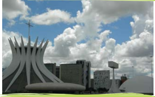
THE MODERN CATHEDRAL