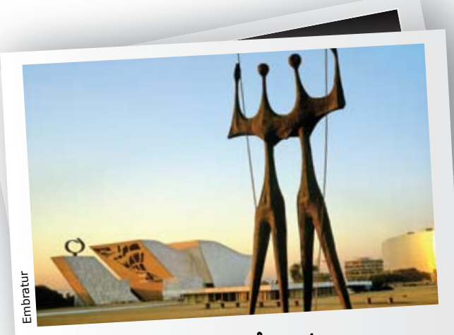
memorial to original workers