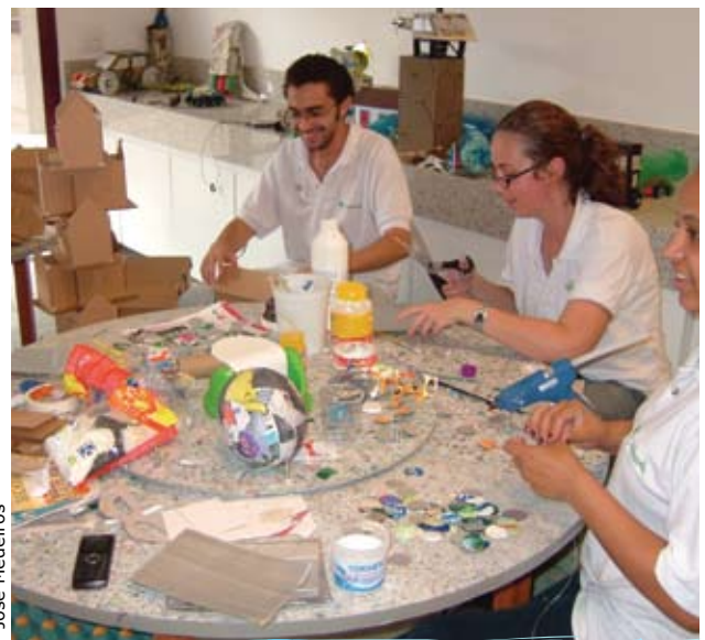
BRAZILIANS ORIGINATE FROM ALL OVER THE WORLD