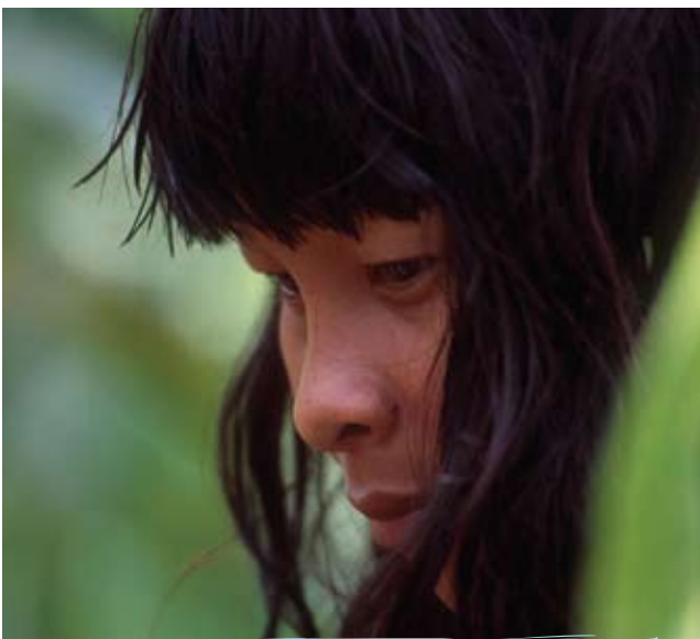
XINGU INDIAN GIRL

settlers after the discovery of the country – mainly Portuguese;