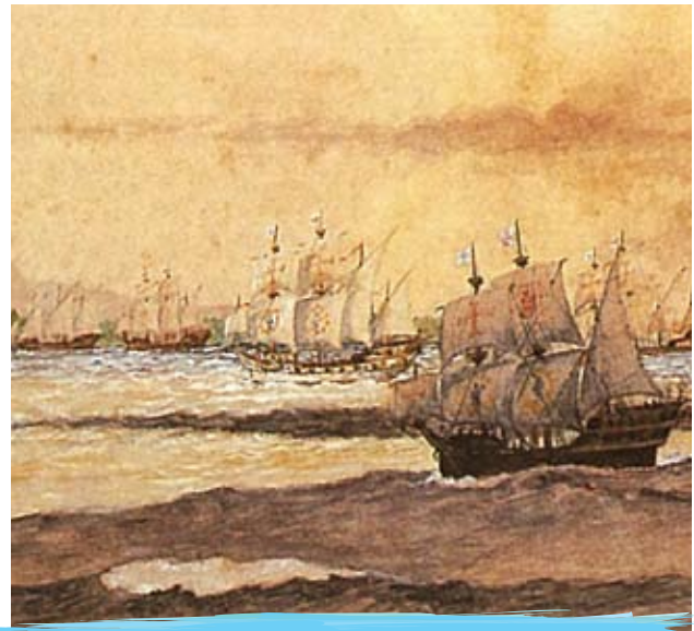
EARLY PORTUGUESE EXPLORERS

In the 17th century sugar cane was introduced as a crop and soon large plantations were developed to grow it for export to Europe. The Portuguese landowners then had to bring captured slaves from Africa to work in the plantations. The Portuguese settlers frequently intermarried with both the Indians and the African slaves, and there were also mixed marriages between the Africans and Indians. As a result Brazil's population is a mixture of cultures and races. Most Brazilians possess some combination of European, African, Amerindian, Asian, and Middle Eastern background.