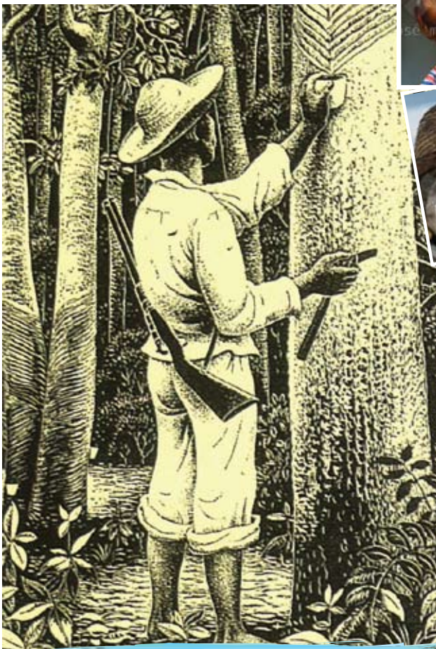
A RUBBER TAPPER

Around a hundred years ago many people travelled from Europe to start new lives abroad. Opportunities existed for people to work in Brazil on sugar plantations and in the the rubber industry, and when coffee took the place of sugar as Brazil's most important product, a wave of European immigrants settled in the country.