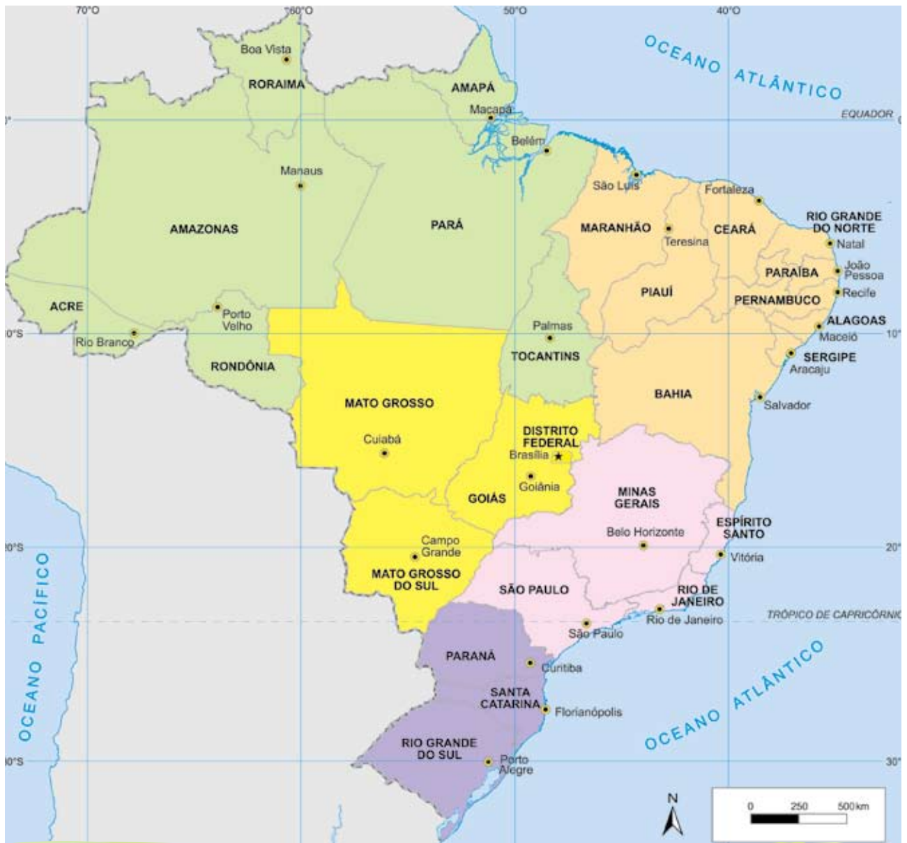
BRAZIL CONSISTS OF FIVE REGIONS