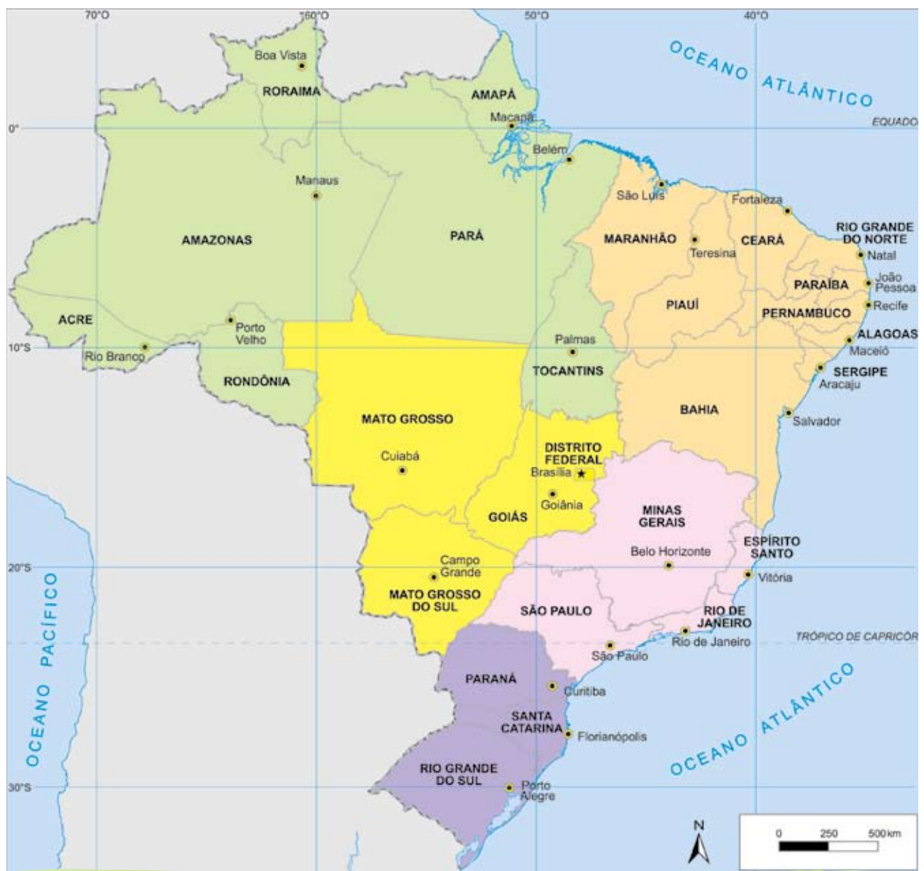
BRAZIL CONSISTS OF FIVE REGIONS